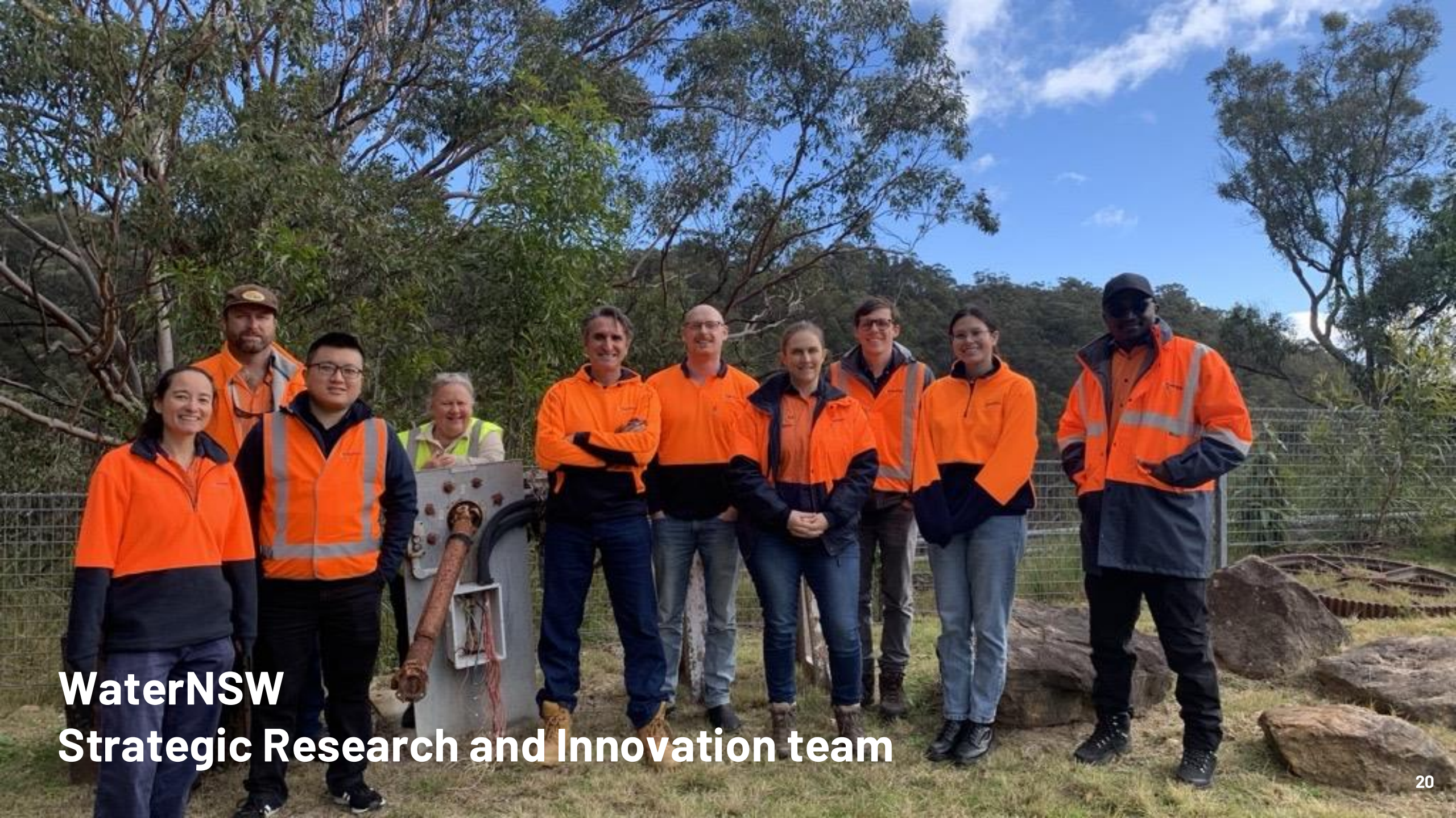
WaterNSW Strategic Research and Innovation team